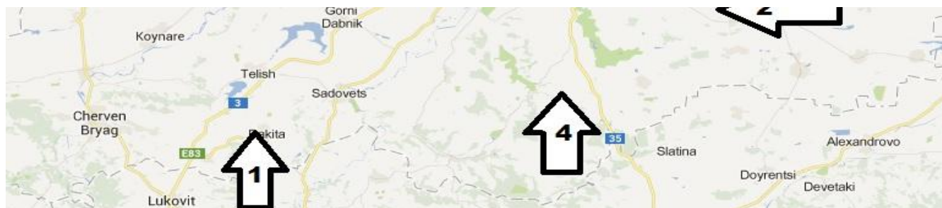
map of the track